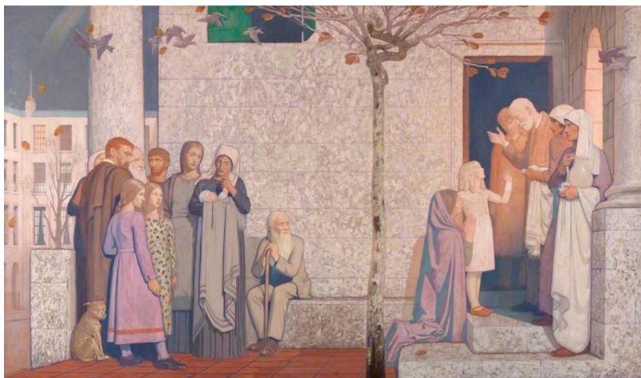
Frederick Cayley Robinson (1862–1927) Acts of mercy 1 st painting

The Wellcome Library's collections of paintings, drawings, prints and photographs were created to document a particular range of subjects in all places and at all times, and the 'Works of Mercy' is one of those subjects. The Library already had a number of pictures on this theme when it acquired in 2009 four large paintings called Acts of Mercy by Frederick Cayley Robinson (1862–1927). Cayley Robinson's four paintings were originally commissioned to hang in the entrance hall of the Middlesex Hospital in London, where they inspired thousands of patients and staff members over the years.