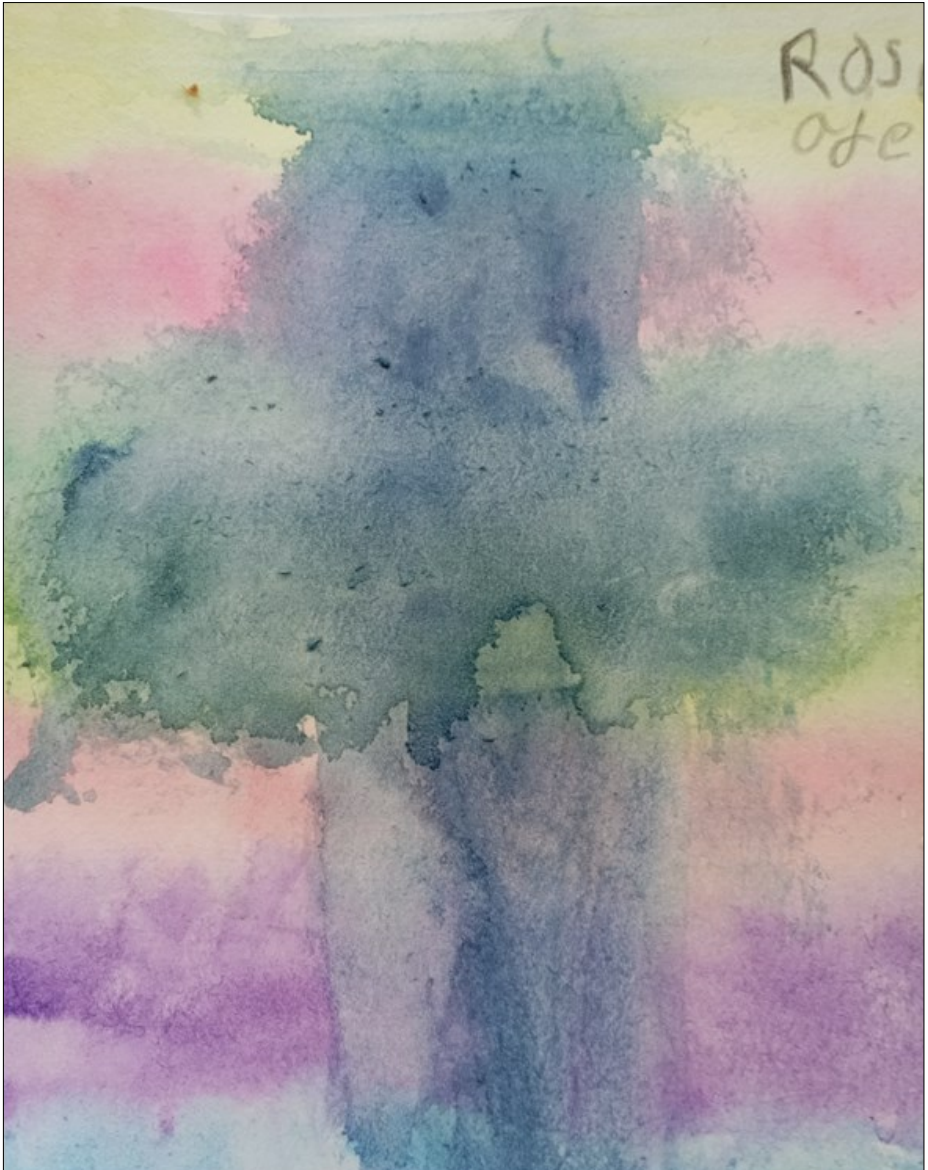
Watercolour of the Cross by Rosie – A child's hand pinpoints the beauty, the promise and the truth of the sacrifice on the Cross.