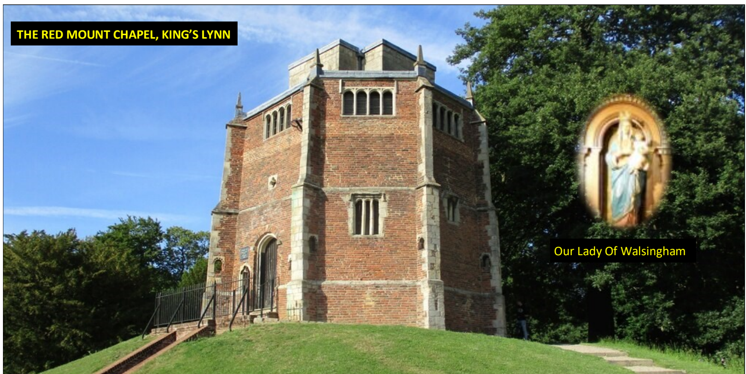
THE RED MOUNT CHAPEL, KING'S LYNN